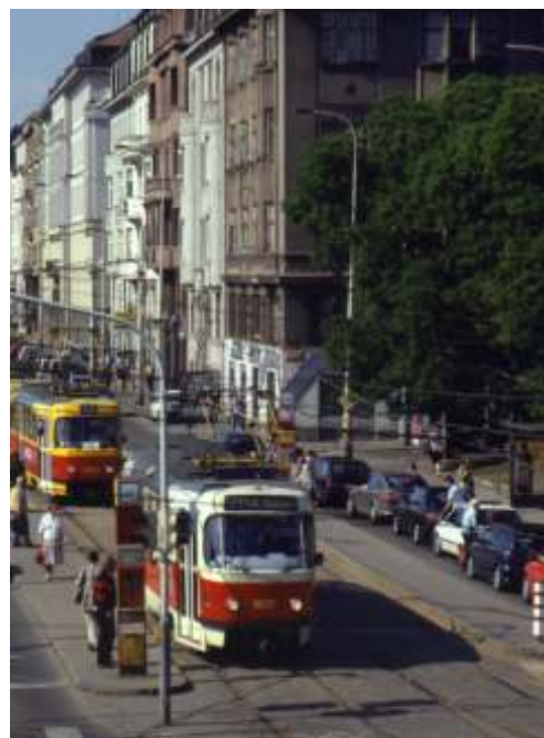
Prague - tramcar after refurbishment