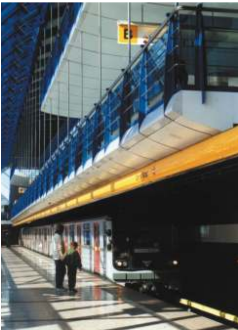
Prague - metro car