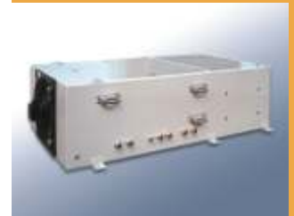
Container arrangement of traction equipment