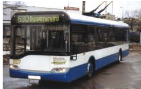
Trolley-bus SOLARIS with TV Progress and static converter SMTK equipments