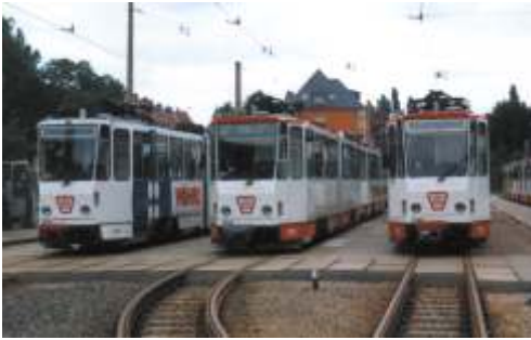
Zwickau (Germany) - tramcars after refurbishment