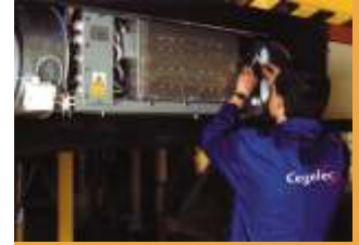
Static converter with DC and AC outputs