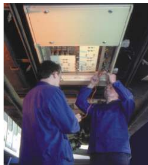
Assembly of TV Progress traction equipment

MPK Gdansk Poland, PMDP Plzeň Czech Republic, PARS Šumperk Czech Republic, PROTRAM Wrocław Poland, SVZ Zwickau Germany, TRAMCAR Sofia Bulgaria, VGG Görlitz Germany, TP Dnepropetrovsk Ukraine, OGET Odessa Ukraine, TP Kiev Ukraine, TP Izhevsk Russia, GSP Belgrade Yugoslavia